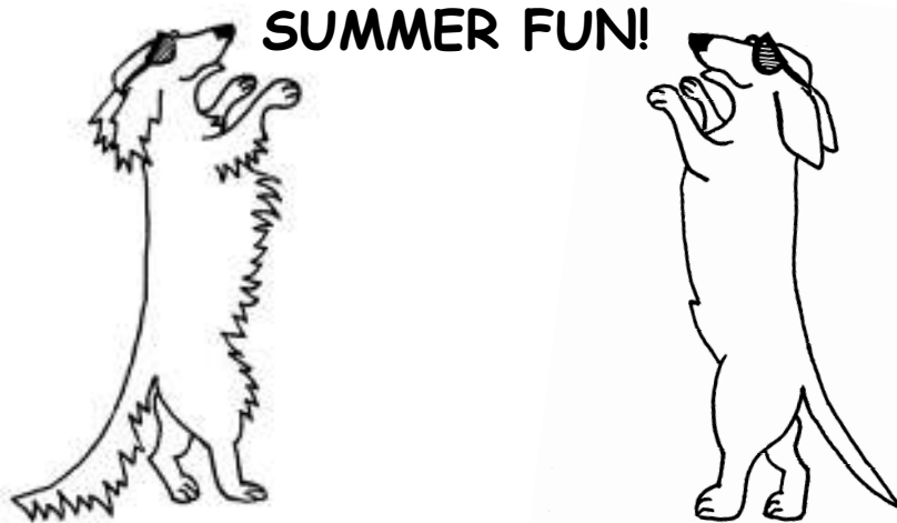
All Dachshund Clip Art

First Prize.....Rose Second Prize.....Brown Third Prize.....Light Green Fourth Prize.....Gray